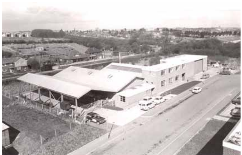
Winchester Road, Basingstoke, 1964